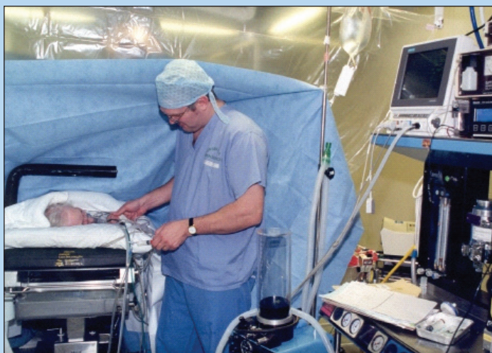
Hip Replacement Surgery using Spinal anaesthetic

mouth or throat. They will also explain how you might feel after the operation, what sort of pain relief you should expect, and if you will go to the high dependency or intensive care ward. Patients with DM are much more likely to need a higher level of care after an operation. This is routine and nothing to worry about.